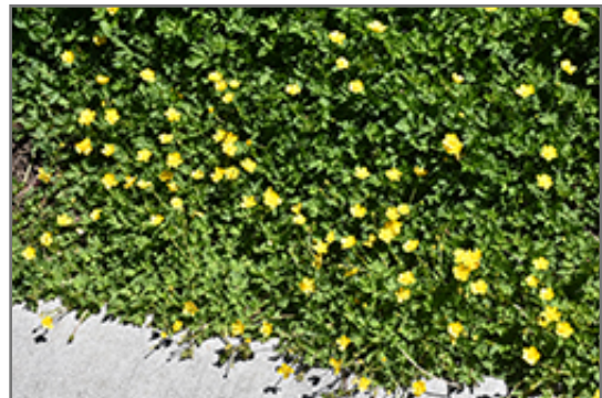
Barren Strawberry in bloom