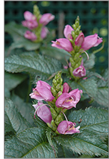
Hot Lips Turtlehead flowers

Hot Lips Turtlehead is recommended for the following landscape applications;