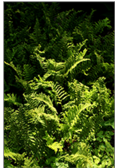
Lady Fern foliage