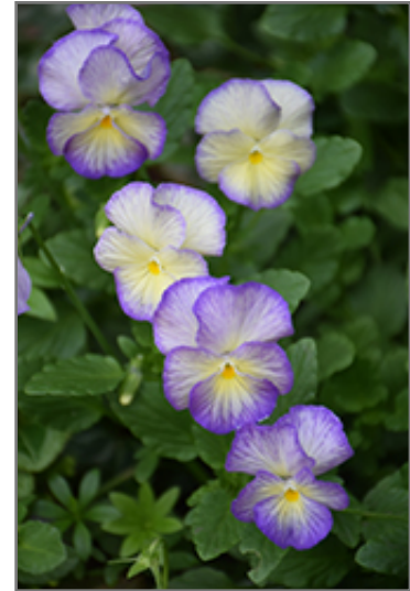
Etain Pansy flowers

Etain Pansy is recommended for the following landscape applications;