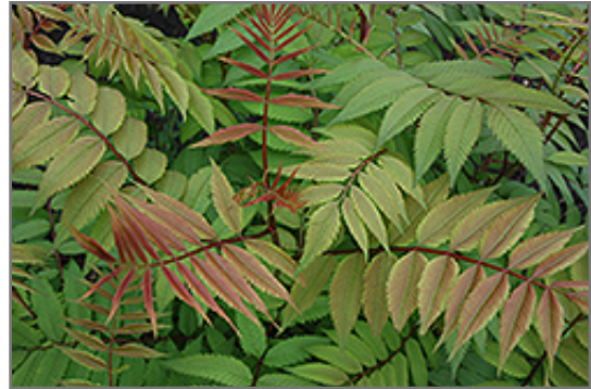
Sem False Spirea foliage

This shrub will require occasional maintenance and upkeep, and is best pruned in late winter once the threat of extreme cold has passed. Gardeners should be aware of the following characteristic(s) that may warrant special consideration;