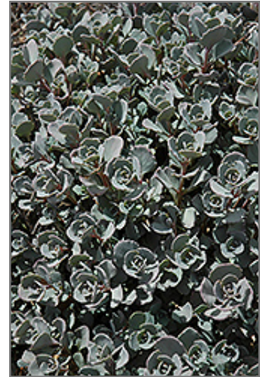
Lidakense Stonecrop foliage