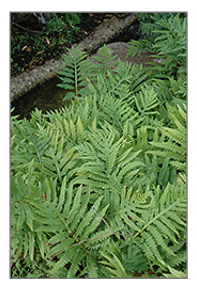
Sensitive Fern foliage