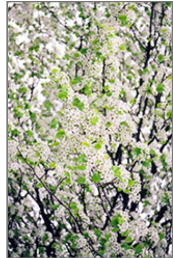
Bradford Ornamental Pear flowers

47747 Romeo Plank Road | Macomb, Mi 48044