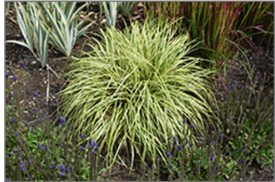
Evergold Variegated Japanese Sedge foliage

Evergold Variegated Japanese Sedge will grow to be about 8 inches tall at maturity, with a spread of 12 inches. Its foliage tends to remain low and dense right to the ground. It grows at a medium rate, and under ideal conditions can be expected to live for approximately 10 years. As an evergreen perennial, this plant will typically keep its form and foliage year-round.