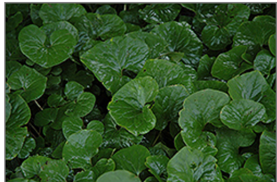
Canadian Wild Ginger

47747 Romeo Plank Road | Macomb, Mi 48044