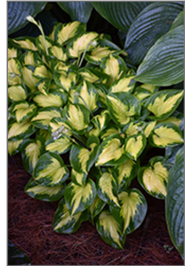
Shadowland Etched Glass Hosta