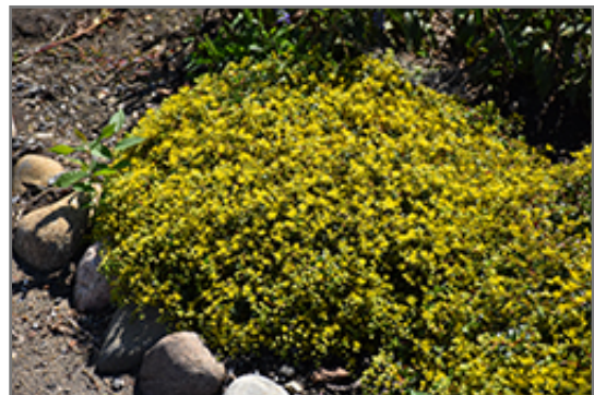
Rock 'N Low Yellow Brick Road Stonecrop in bloom

47747 Romeo Plank Road | Macomb, Mi 48044