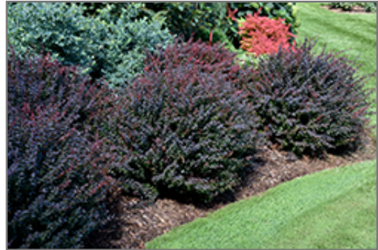
Sunjoy Mini Maroon Japanese Barberry

Sunjoy Mini Maroon Japanese Barberry is recommended for the following landscape applications;