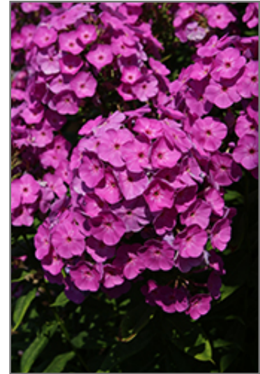
Garden Girls Cover Girl Garden Phlox flowers