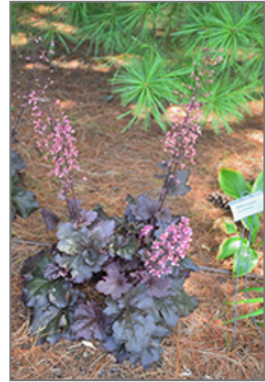
Primo Mahogany Monster Coral Bells in bloom

* This is a 'special order' plant - contact store for details