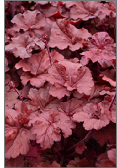
Primo Mahogany Monster Coral Bells foliage

Primo Mahogany Monster Coral Bells is a dense herbaceous evergreen perennial with tall flower stalks held atop a low mound of foliage. Its relatively fine texture sets it apart from other garden plants with less refined foliage.