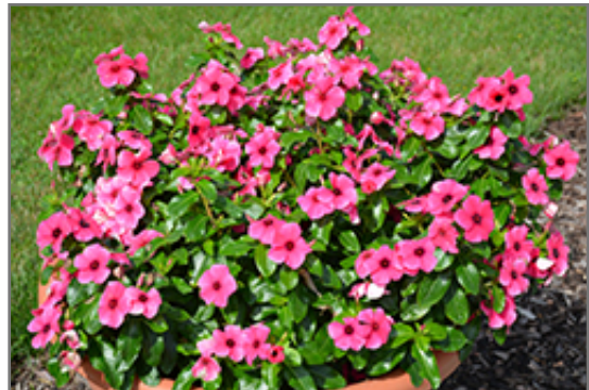
Tattoo Raspberry Vinca in bloom