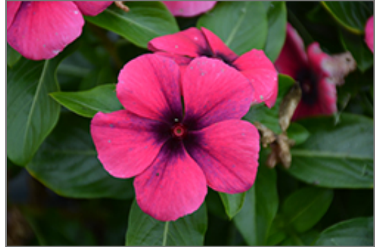
Tattoo Raspberry Vinca flowers

Tattoo Raspberry Vinca is a dense herbaceous annual with a mounded form. Its medium texture blends into the garden, but can always be balanced by a couple of finer or coarser plants for an effective composition.