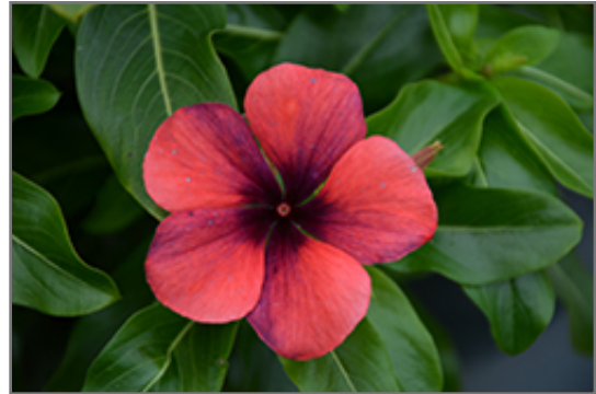
Tattoo Papaya Vinca flowers

Tattoo Papaya Vinca is recommended for the following landscape applications;