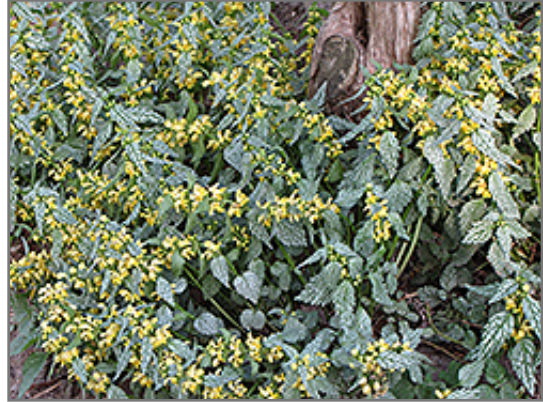
Hermann's Pride Yellow Archangel in bloom

* This is a 'special order' plant - contact store for details