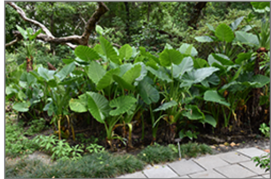
Calidora Elephant's Ear

Calidora Elephant's Ear is recommended for the following landscape applications;