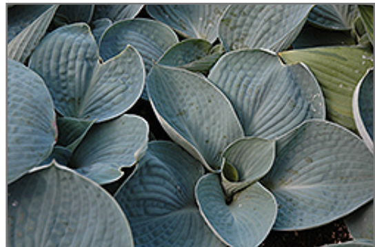
Love Pat Hosta foliage