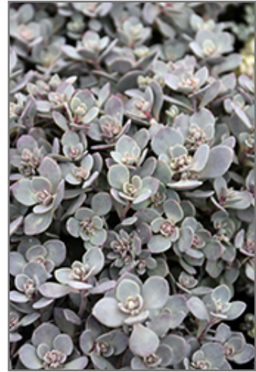
SunSparkler Blue Elf Sedoro foliage

SunSparkler Blue Elf Sedoro is a fine choice for the garden, but it is also a good selection for planting in outdoor pots and containers. Because of its spreading habit of growth, it is ideally suited for use as a 'spiller' in the 'spiller-thriller-filler' container combination; plant it near the edges where it can spill gracefully over the pot. Note that when growing plants in outdoor containers and baskets, they may require more frequent waterings than they would in the yard or garden.