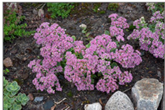
Lime Twister Stonecrop in bloom