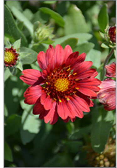
Mesa Red Blanket Flower flowers

Mesa Red Blanket Flower is recommended for the following landscape applications;