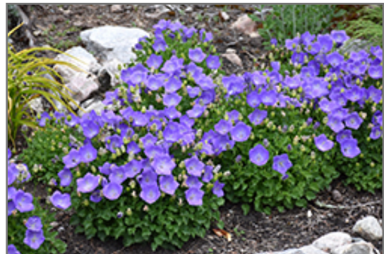
Rapido Blue Bellflower in bloom