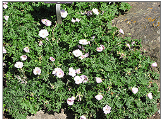
Striated Cranesbill in bloom