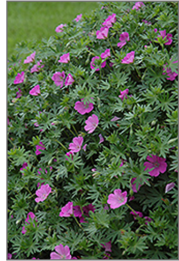
Bloody Cranesbill flowers