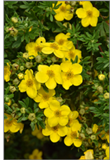
Happy Face Yellow Potentilla flowers

Happy Face Yellow Potentilla is recommended for the following landscape applications;