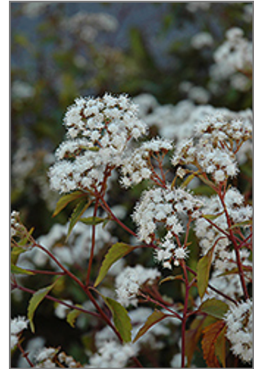
Chocolate Boneset flowers

Chocolate Boneset is recommended for the following landscape applications;