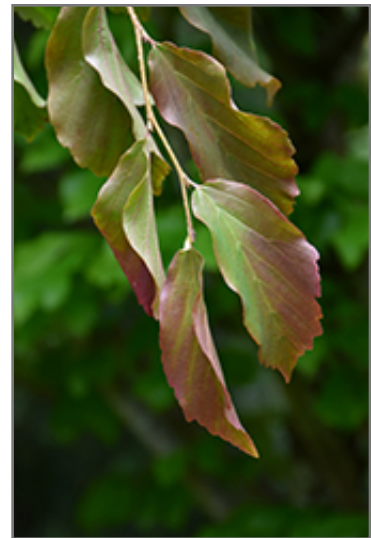
Ruby Vase Parrotia foliage