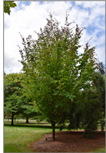
Ruby Vase Parrotia