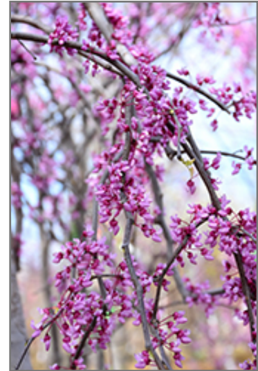
Pink Heartbreaker Redbud flowers

Pink Heartbreaker Redbud is recommended for the following landscape applications;