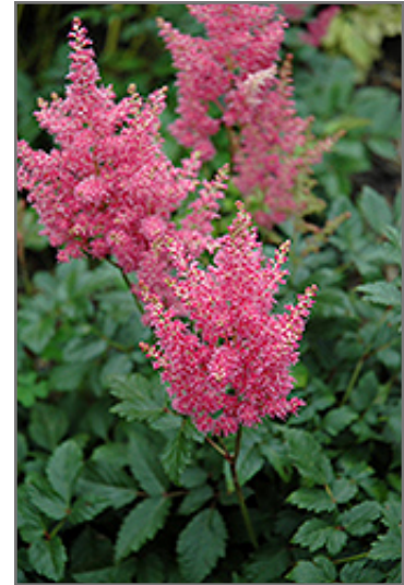
Rheinland Astilbe flowers

Rheinland Astilbe is recommended for the following landscape applications;