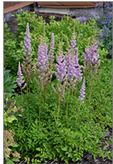
Dwarf Chinese Astilbe in bloom