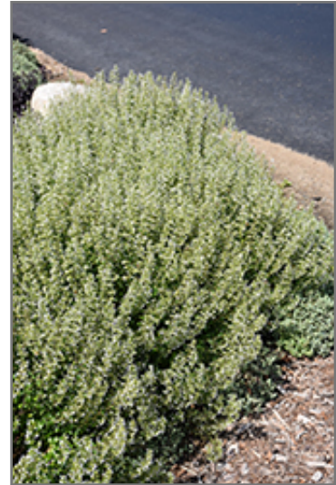
White Cloud Dwarf Calamint in bloom