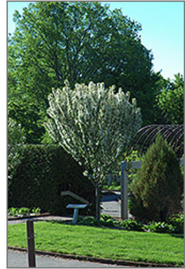
Adirondack Flowering Crab in bloom