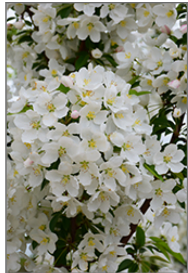
Adirondack Flowering Crab flowers

47747 Romeo Plank Road | Macomb, Mi 48044