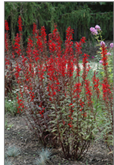
Black Truffle Cardinal Flower in bloom

47747 Romeo Plank Road | Macomb, Mi 48044