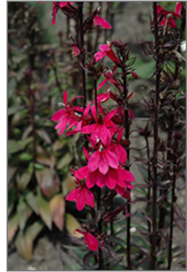
Starship Deep Rose Lobelia flowers

Starship Deep Rose Lobelia is recommended for the following landscape applications;