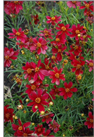
Red Satin Tickseed flowers