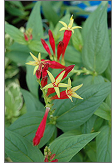
Indian Pink flowers

Indian Pink is recommended for the following landscape applications;