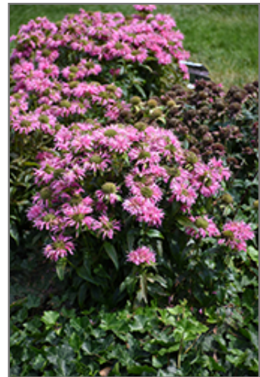
Pardon My Pink Beebalm in bloom