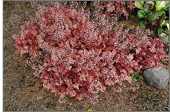
Peach Crisp Coral Bells in bloom

This is a relatively low maintenance plant, and should be cut back in late fall in preparation for winter. It is a good choice for attracting hummingbirds to your yard. It has no significant negative characteristics.