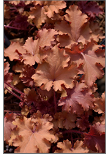
Peach Crisp Coral Bells foliage

Peach Crisp Coral Bells will grow to be about 14 inches tall at maturity extending to 20 inches tall with the flowers, with a spread of 18 inches. When grown in masses or used as a bedding plant, individual plants should be spaced approximately 15 inches apart. Its foliage tends to remain dense right to the ground, not requiring facer plants in front. It grows at a medium rate, and under ideal conditions can be expected to live for approximately 10 years. As an evergreen perennial, this plant will typically keep its form and foliage year-round.