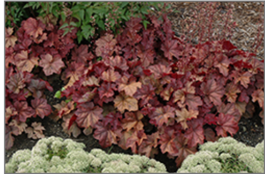
Lava Lamp Coral Bells

Lava Lamp Coral Bells will grow to be about 16 inches tall at maturity extending to 32 inches tall with the flowers, with a spread of 28 inches. When grown in masses or used as a bedding plant, individual plants should be spaced approximately 24 inches apart. Its foliage tends to remain dense right to the ground, not requiring facer plants in front. It grows at a medium rate, and under ideal conditions can be expected to live for approximately 10 years. As an evergreen perennial, this plant will typically keep its form and foliage year-round.