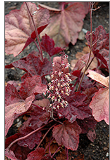
Lava Lamp Coral Bells flowers