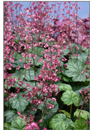
Berry Timeless Coral Bells flowers