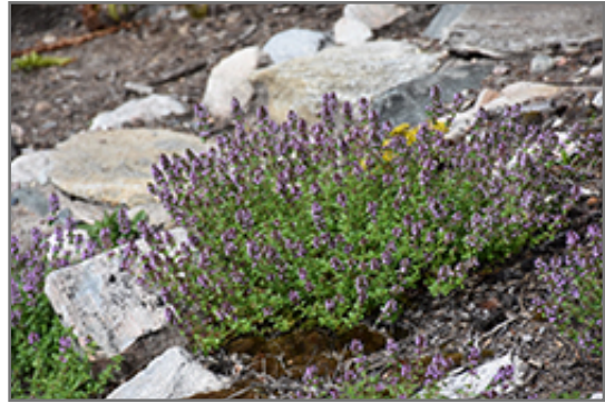
Lemon Thyme in bloom

This plant is quite ornamental as well as edible, and is as much at home in a landscape or flower garden as it is in a designated herb garden. It should only be grown in full sunlight. It prefers to grow in average to dry locations, and dislikes excessive moisture. It is considered to be drought-tolerant, and thus makes an ideal choice for a low-water garden or xeriscape application. It is not particular as to soil type or pH. It is highly tolerant of urban pollution and will even thrive in inner city environments. Consider covering it with a thick layer of mulch in winter to protect it in exposed locations or colder microclimates. This particular variety is an interspecific hybrid. It can be propagated by division; however, as a cultivated variety, be aware that it may be subject to certain restrictions or prohibitions on propagation.