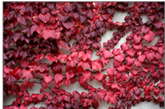
Veitch Boston Ivy in fall