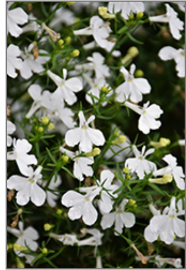
Bella Bianca Lobelia flowers