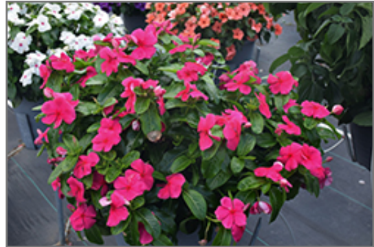
Titan Punch Vinca in bloom

Titan Punch Vinca will grow to be about 14 inches tall at maturity, with a spread of 12 inches. Its foliage tends to remain dense right to the ground, not requiring facer plants in front. Although it's not a true annual, this fast-growing plant can be expected to behave as an annual in our climate if left outdoors over the winter, usually needing replacement the following year. As such, gardeners should take into consideration that it will perform differently than it would in its native habitat.