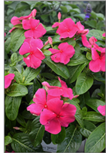
Titan Punch Vinca flowers

Titan Punch Vinca is recommended for the following landscape applications;