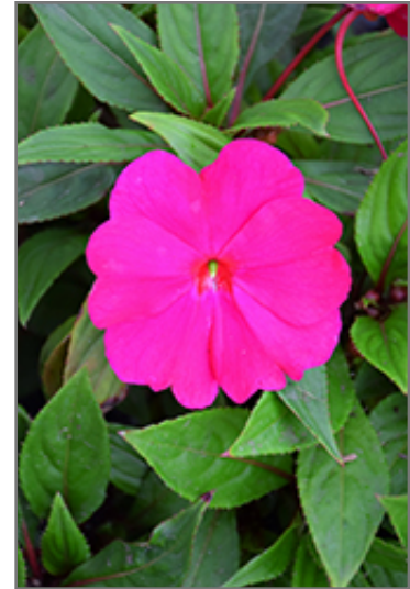
Divine Violet New Guinea Impatiens flowers

Divine Violet New Guinea Impatiens is recommended for the following landscape applications;