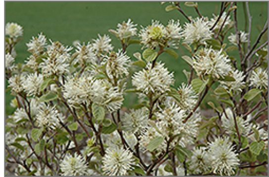
Dwarf Fothergilla flowers

This shrub does best in full sun to partial shade. It requires an evenly moist well-drained soil for optimal growth, but will die in standing water. It is not particular as to soil type, but has a definite preference for acidic soils, and is subject to chlorosis (yellowing) of the foliage in alkaline soils. It is somewhat tolerant of urban pollution. This species is native to parts of North America.