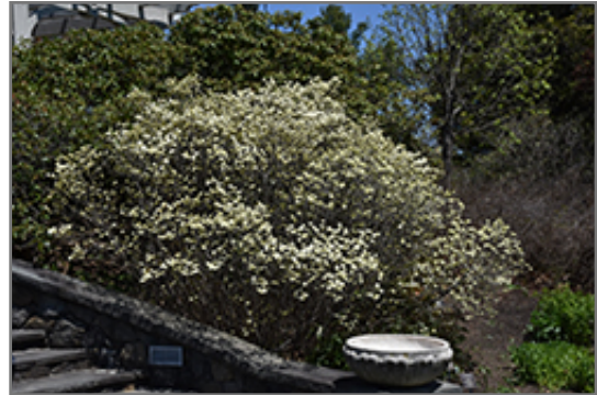
Dwarf Fothergilla in bloom

Dwarf Fothergilla is recommended for the following landscape applications;