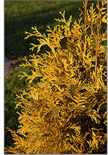
Yellow Ribbon Arborvitae in fall

This shrub does best in full sun to partial shade. It prefers to grow in average to moist conditions, and shouldn't be allowed to dry out. It is not particular as to soil type or pH. It is somewhat tolerant of urban pollution, and will benefit from being planted in a relatively sheltered location. Consider applying a thick mulch around the root zone in winter to protect it in exposed locations or colder microclimates. This is a selection of a native North American species.