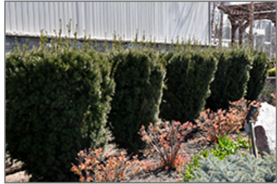
Hicks Yew

Hicks Yew will grow to be about 18 feet tall at maturity, with a spread of 10 feet. It has a low canopy with a typical clearance of 1 foot from the ground, and is suitable for planting under power lines. It grows at a slow rate, and under ideal conditions can be expected to live for 50 years or more.