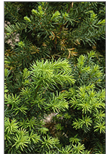
Hicks Yew foliage